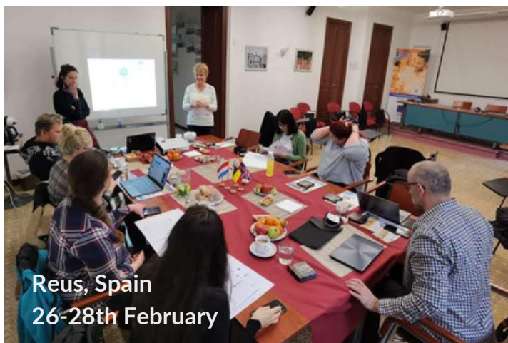
Reus, Spain 26-28th February

We also encourage you to visit the project's Facebook profile where all updates and interesting information related to the topic of the project appear.